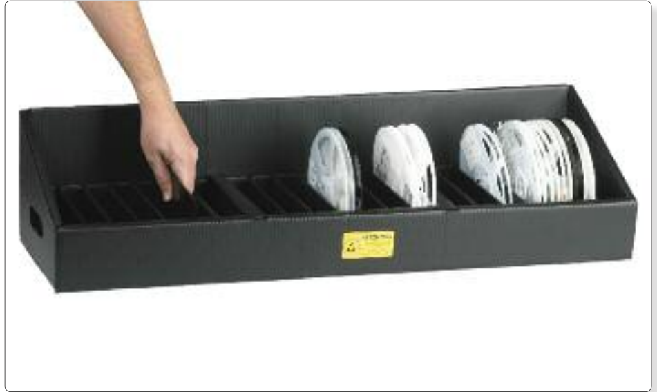
7" Triple Holder Rack in Corriplast