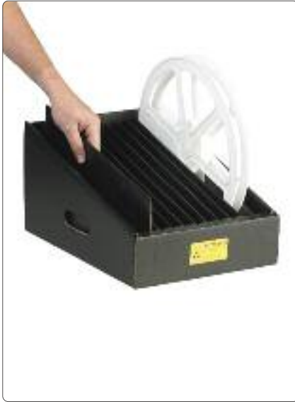
15" Single Reel Holder in Corstat